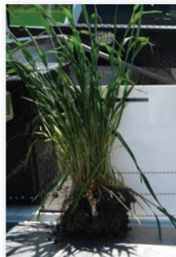
Treated with Accomplish LM