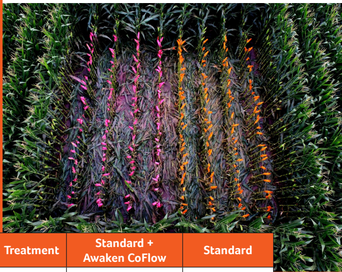
Illinois, Iroquois County, 2018